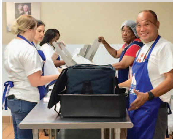
Staff from Maxwell Housing help prepare meals.