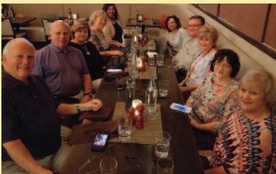
A party of 10 traveled to Charlotte to attend the Meals On Wheels national conference to hear great speakers and learn about great ideas for serving seniors.