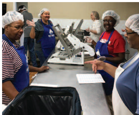
Volunteers from AARP join in the Meal Makers fun.