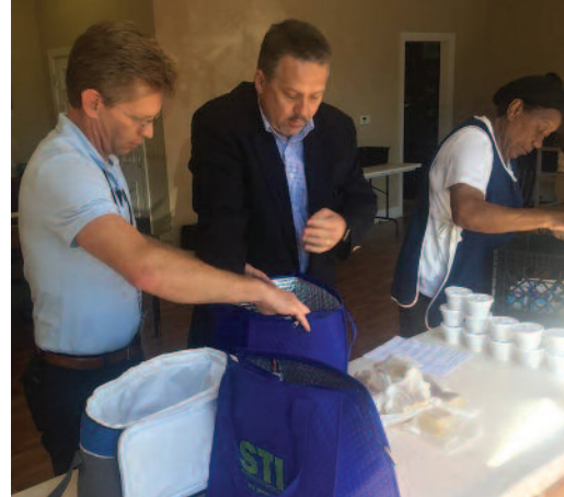
Rotary Members pack meals and prepare for Meals On Wheels delivery