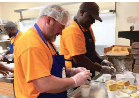
Volunteers with Spire take a turn as MACOA Meal Makers.