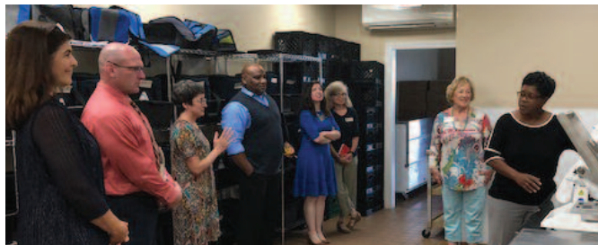
The Legacy Class tours the MACOA Kitchen to learn more about the Meals On Wheels program.