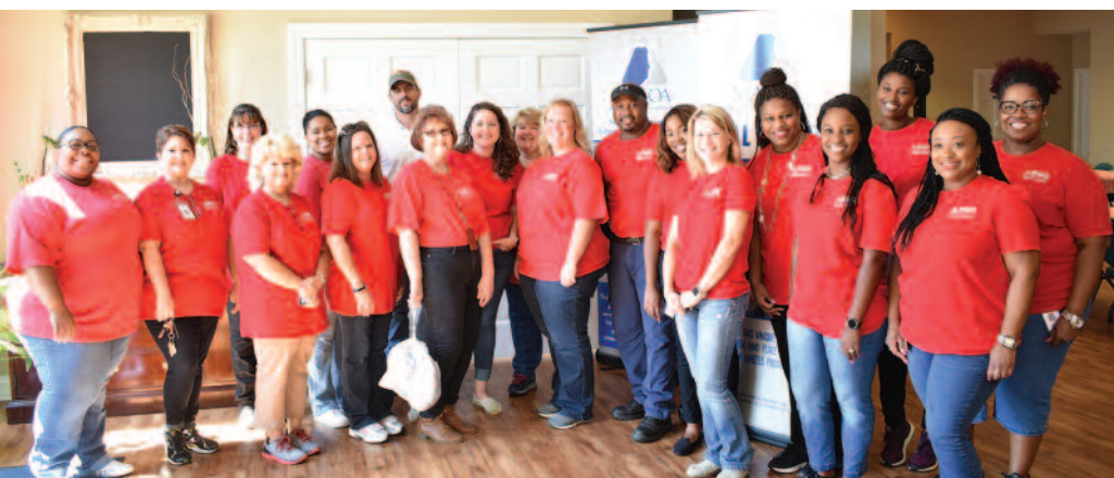
The Alabama Power Company Service Organization spent a morning helping prepare meals for delivery.